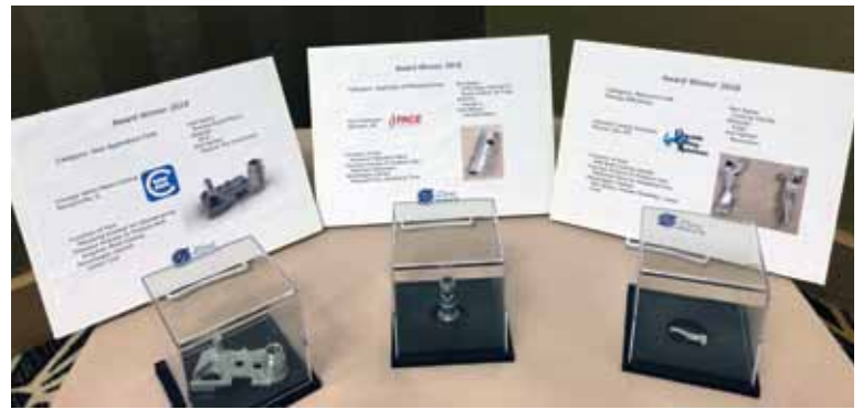
Awards at the Zinc Die Casting Conference featuring two B&L customers

Industry events – The second quarter of the year tends to be a busy time for industry events and 2018 was no exception! B&L staff has enjoyed seeing customers and new faces at the AFS Metalcasting Congress, the NADCA Plant management Conference, the California Metals Coalition Annual Meeting and the Zinc Die Casting Conference – just a few of the events where you might have spotted our logo!